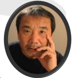
むら かみ はる き 村上春樹